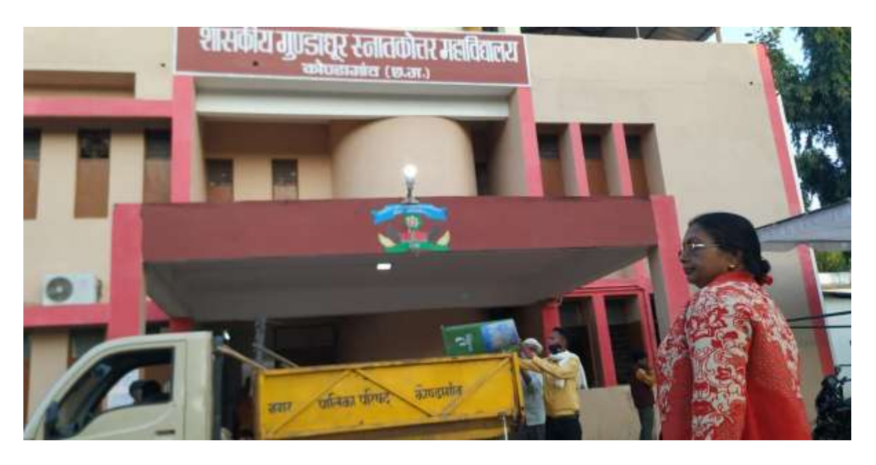
Fig.: Municipal Corporation collecting wastes from college