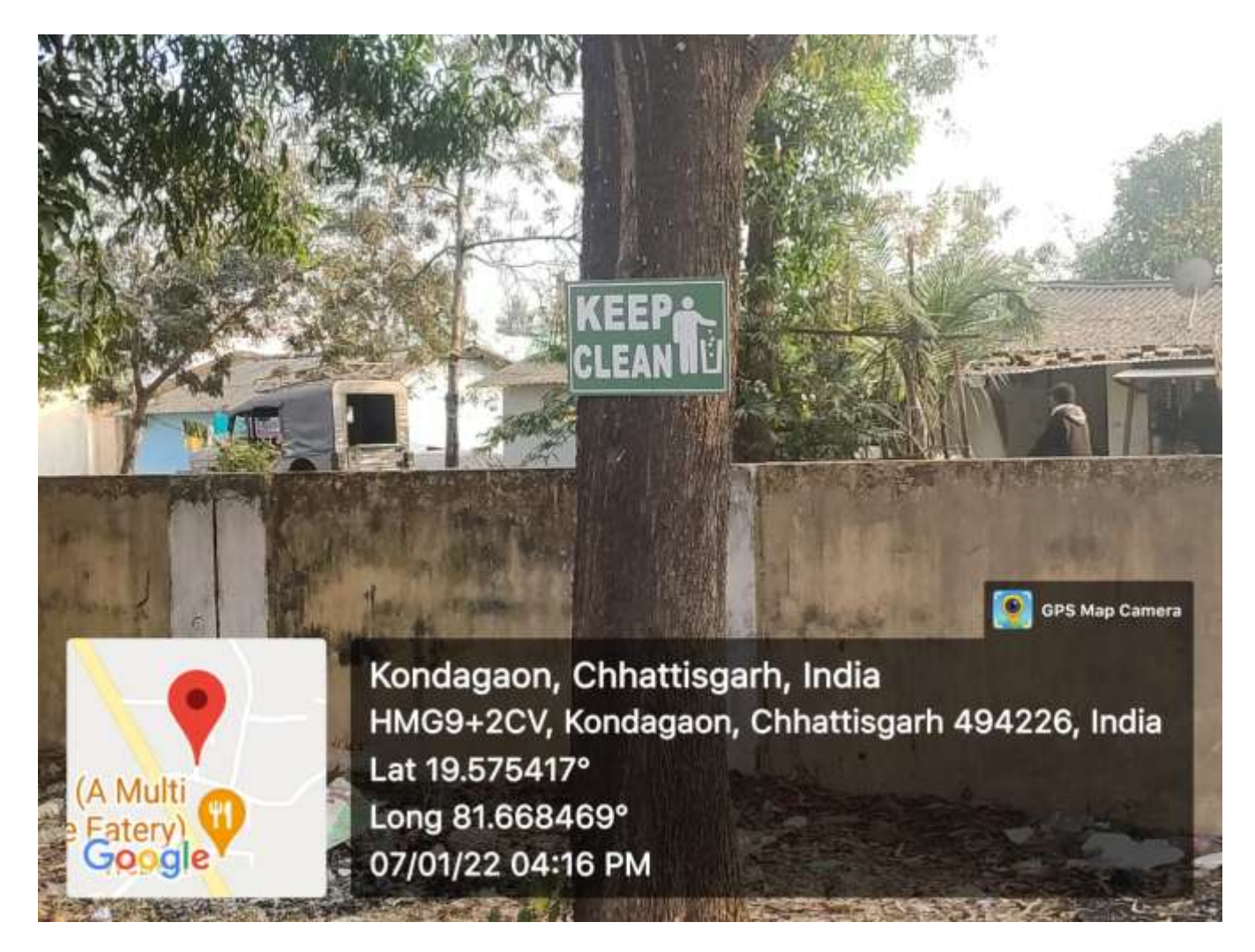
Fig.: Message to "Keep Clean".