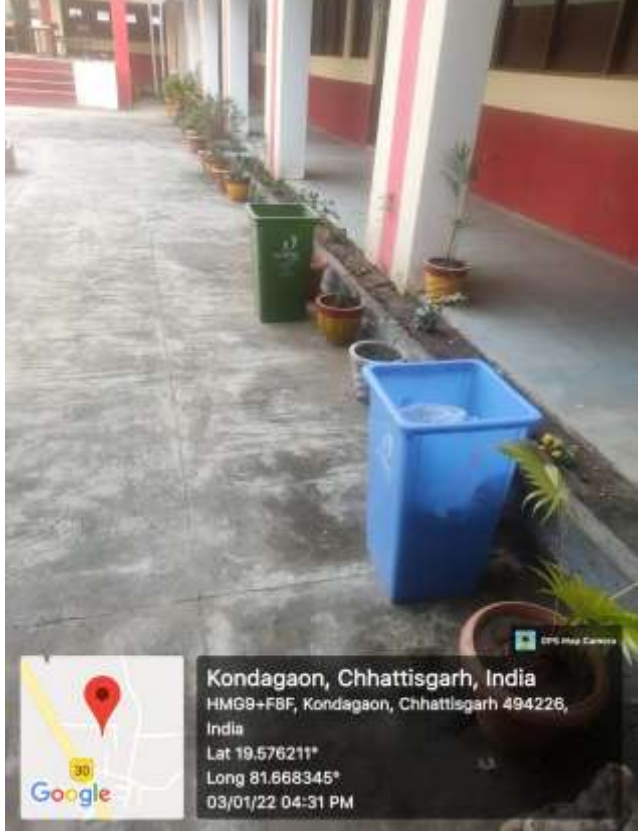
Fig.: Dustbins in college building.