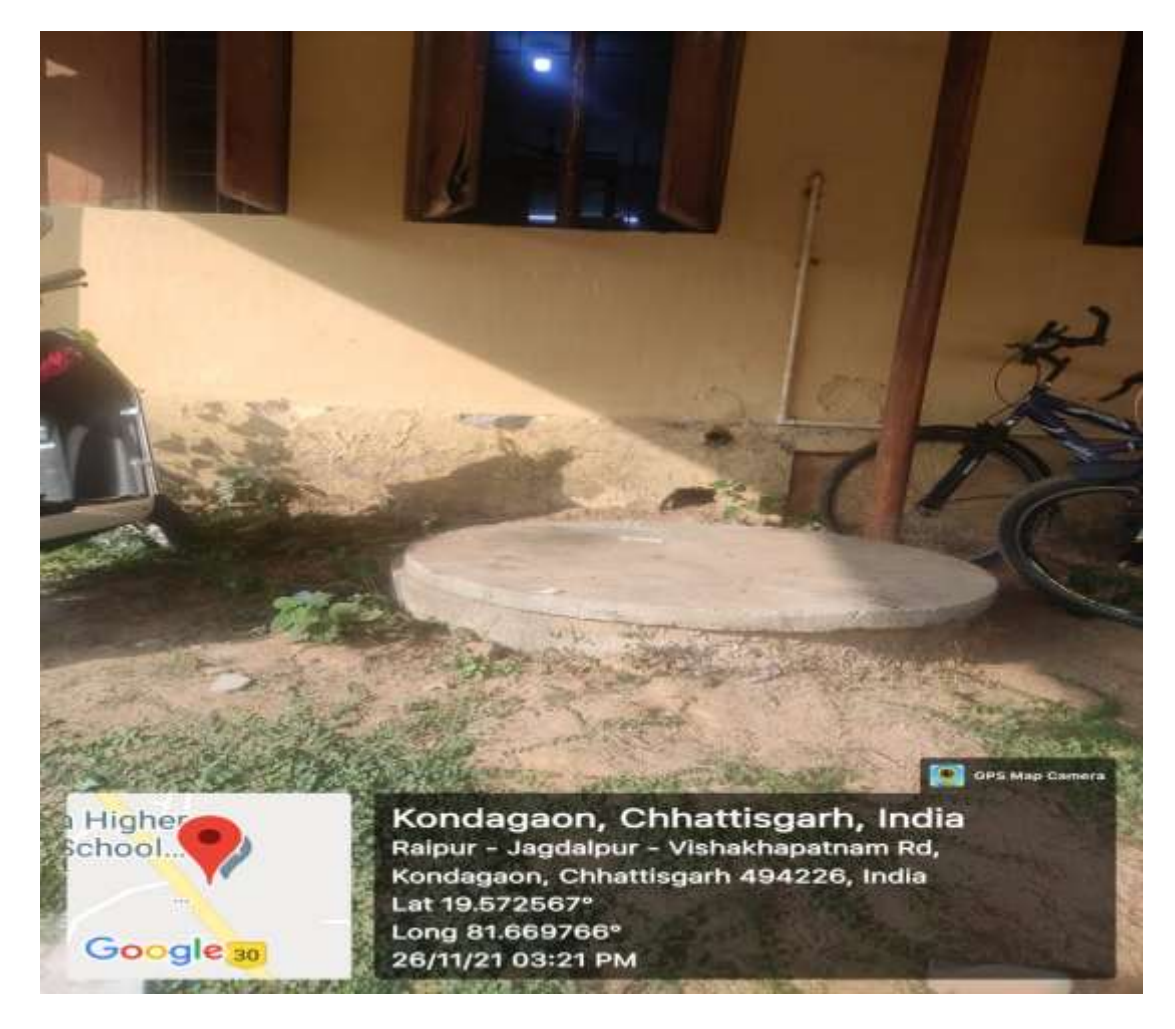
Fig.: Soak-Pit attached with chemistry lab