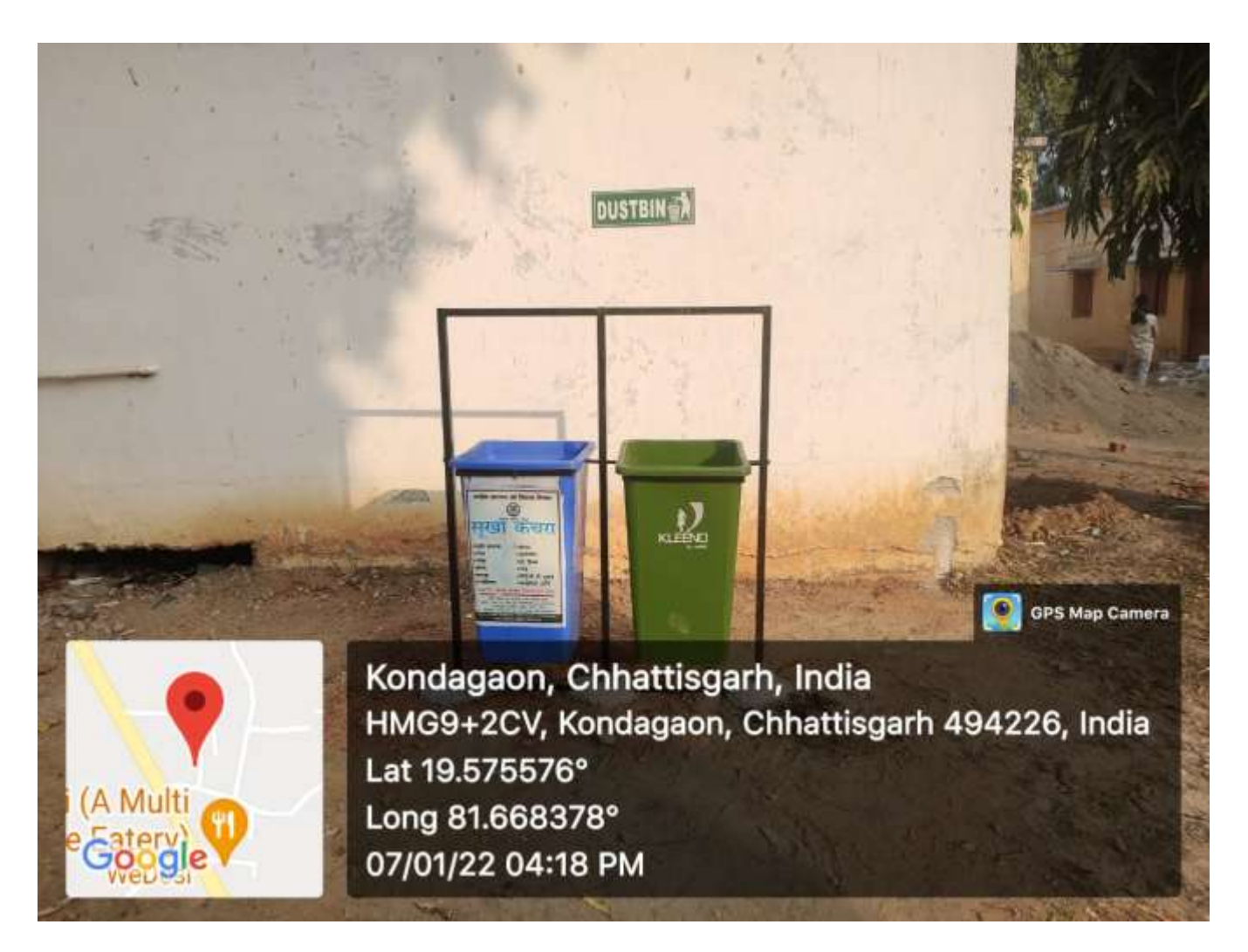
Fig.: Dustbins at outside the college building.