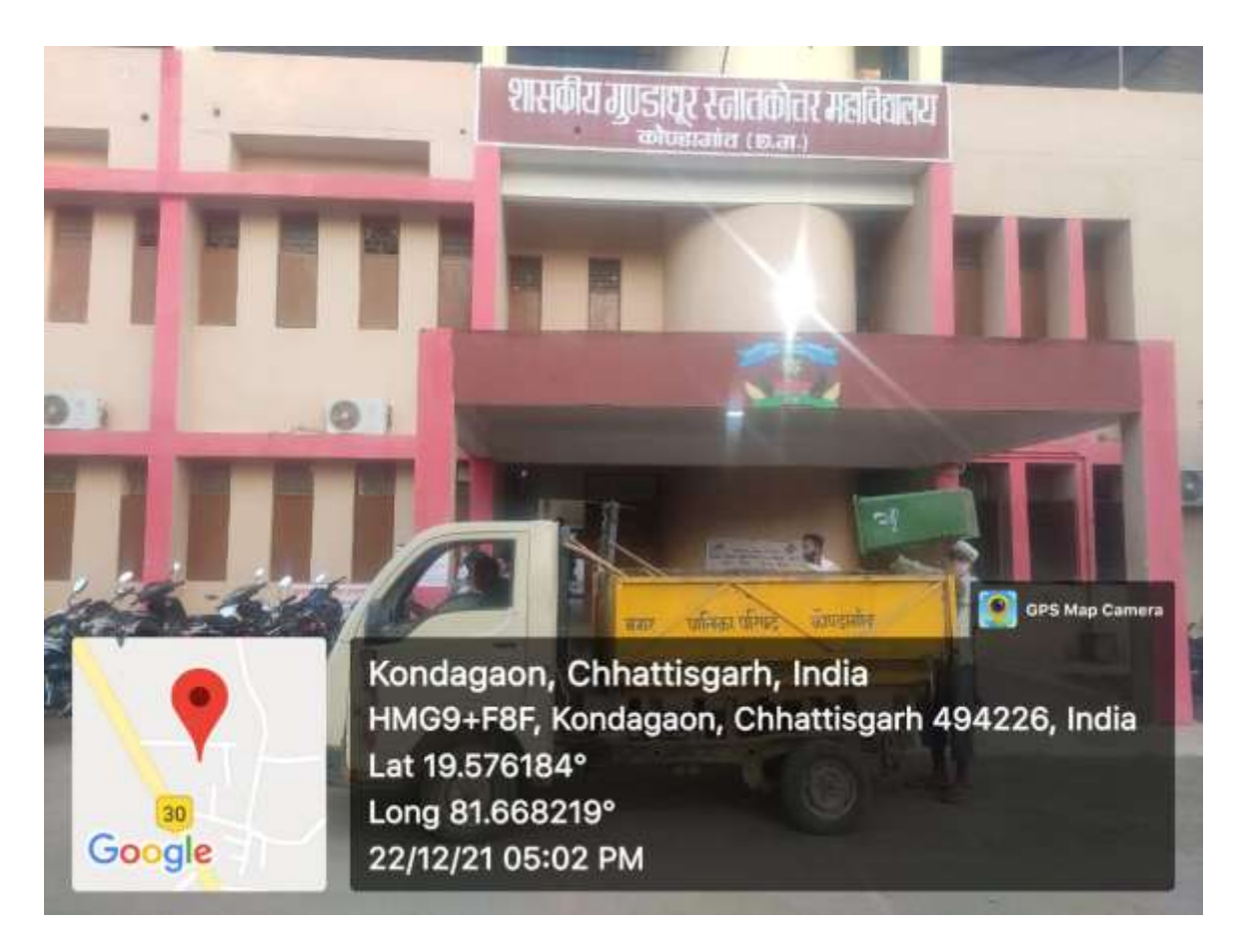
Fig.: Municipal Corporation collecting wastes from college